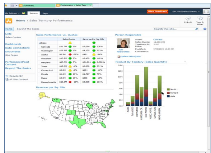
Data visualization can lead to better business decisions.

With SharePoint 2010, you can quickly create no-code solutions and deploy them in an easy and secure way. From simple sites to complex applications, there's a code-free solution for almost every business need.